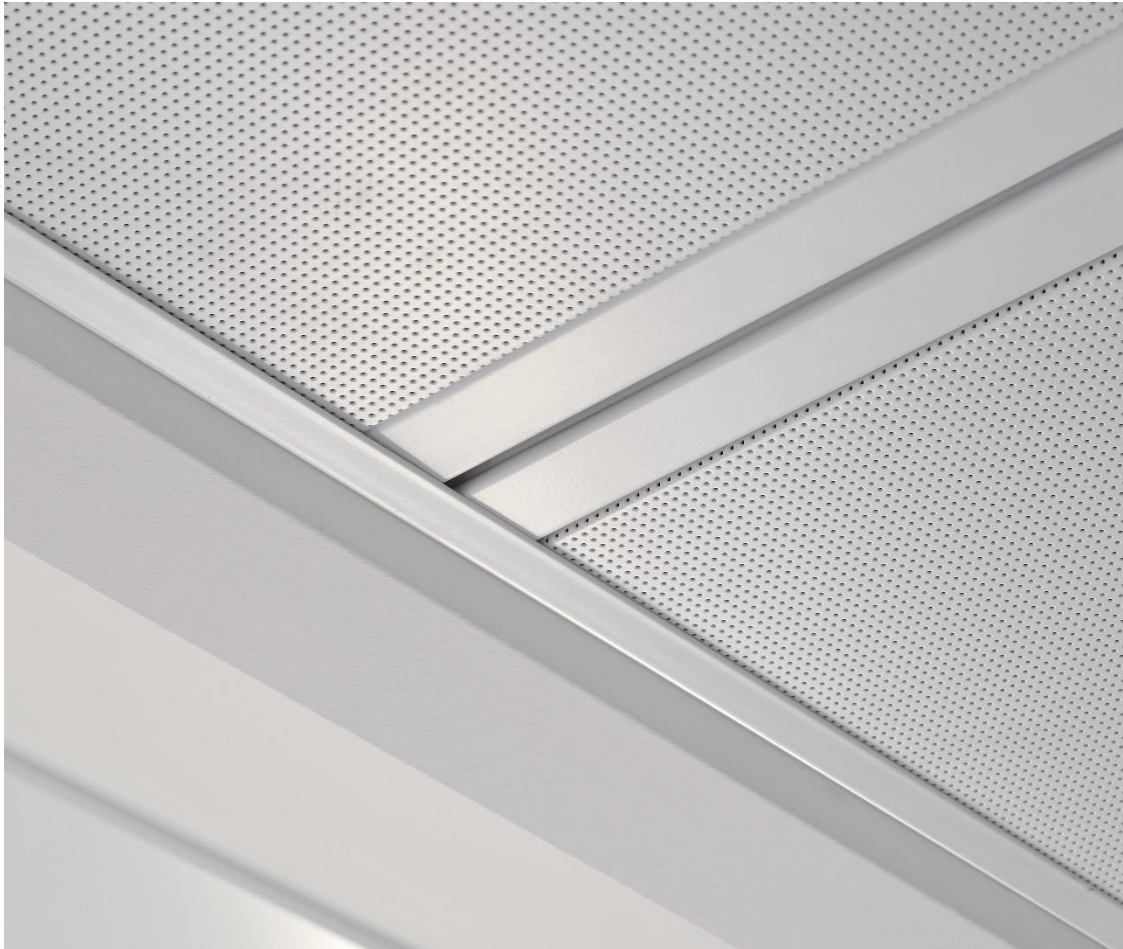
Metal Ceiling System SAS330 Chilled CPC Code 42190

EPDs of construction products may not be comparable if they do not comply with the BS ISO EN15804:2012 standard